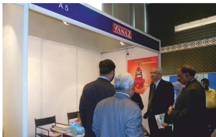
Exhibitor -Vanaz Engineers Ltd www.vanaz.com