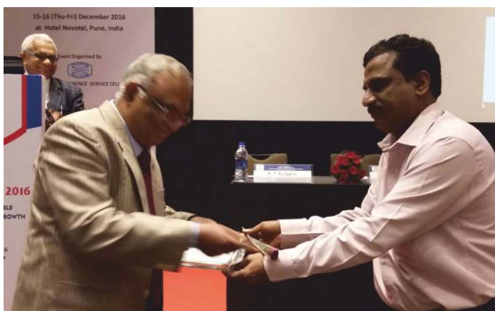
Felicitating to MNGL