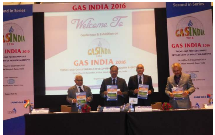
Release of Technical Volume