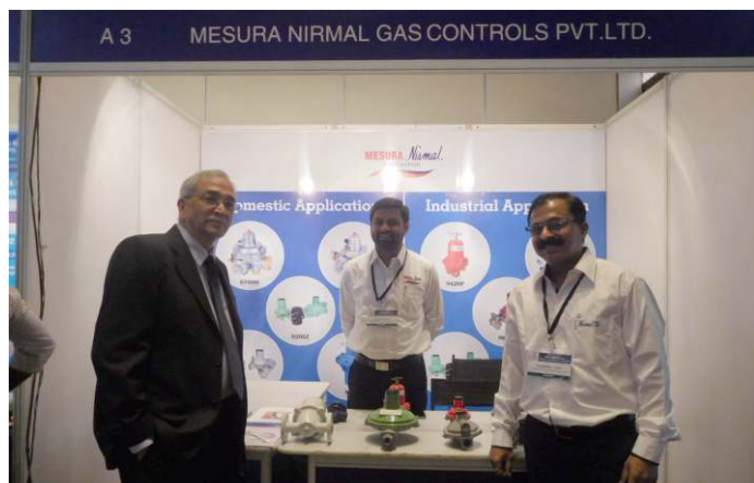
Exhibitor - Mesura Nirmal Gas Control Pvt. Ltd. www.mesuranirmal.com