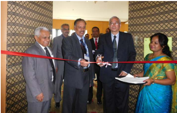
Exhibition Inauguration by Dignitaries