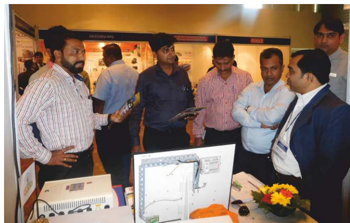
Exhibitor -Realty Automation &Security Pvt. Ltd. www.vighnaharta.in