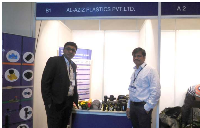
Exhibitor - Al-Aziz Plastics Pvt Ltd. www.alaziz.com