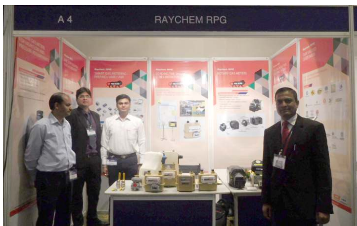
Exhibitor -Raychem RPG (P) Ltd. www.raychemrpg.com