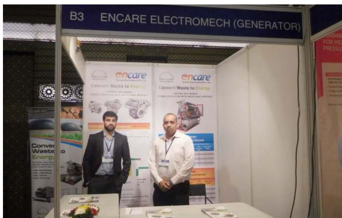
Exhibitor - Encare Electromech Pvt Ltd www.encareelectromech.com