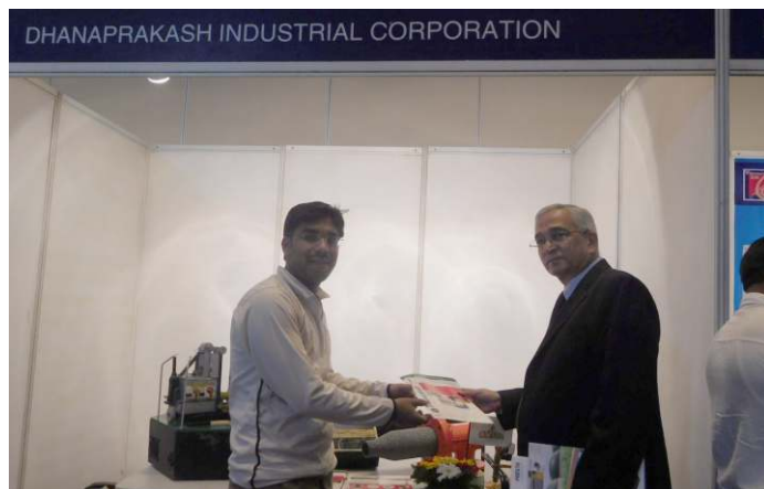
Exhibitor - Dhanprakash Industrial Corporation www.dhanprakash.com