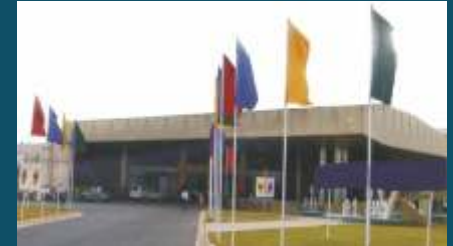
Chennai Trade Centre

4-5-6 (Thu-Fri-Sat) December 2014 Chennai Trade Centre, Chennai, Tamil Nadu, India